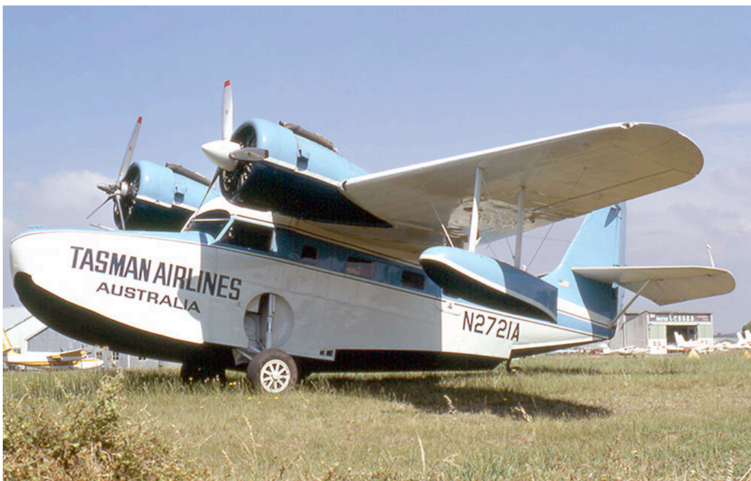
Grumman JRF-5 Goose N2721A (c/n B-54) at Sydney-Bankstown in November 1974.

First flown at Grumman's newly established plant at Bethpage NY on 29 May 1937, the Goose proved to be an outstanding aircraft in both civil and military use. All models were built with variants of the 450hp P&W R-985 Wasp Junior engines. Goose production totalled 345 aircraft, ending in October 1945 at Bethpage.