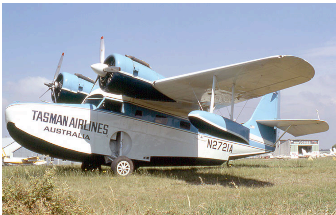
Grumman JRF-5 Goose N2721A (c/n B-54) at Sydney-Bankstown in November 1974.

First flown at Grumman's newly established plant at Bethpage NY on 29 May 1937, the Goose proved to be an outstanding aircraft in both civil and military use. All models were built with variants of the 450hp P&W R-985 Wasp Junior engines. Goose production totalled 345 aircraft, ending in October 1945 at Bethpage.