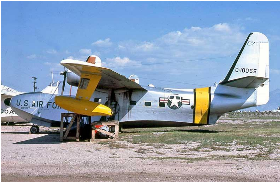
Military: USAF Grumman HU-16B 51-65 in storage at Davis Monthan AFB AZ in October 1977